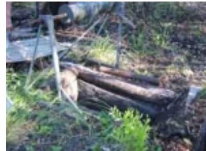
Hand dug slab well