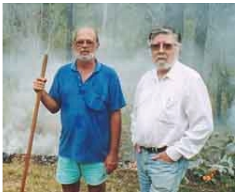
Cookie and Bruce watch over the controlled burn during a clean up of Cookies Park