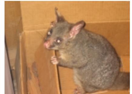
Take care when lighting the stove, we have a new resident in the kitchen

The 17 th December was the Workers Christmas Party and with a drop or two of Christmas cheer and a steak burger we thanked the workers and their partners for their hard effort over the year.