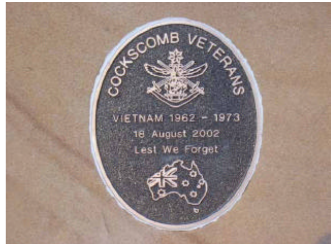
Our Memorial Plaque says it all