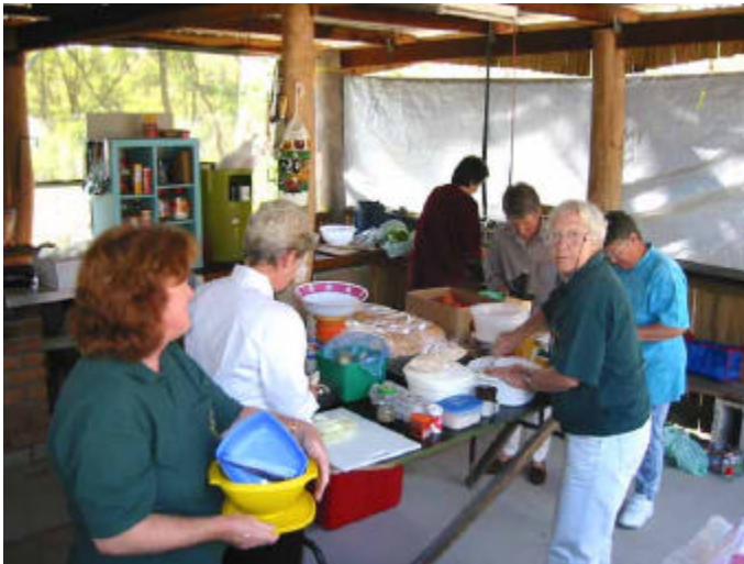
Our Very special Catering core